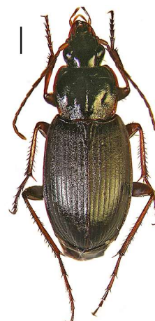
Fig. 1. External appearance of Calathus (Amphiginus) rotundicollis Dejean, 1828 from Kaliningradskaya Oblast of Russia. Scale bar 1 mm.

Рис. 1. Внешний вид жука Calathus (Amphiginus) rotundicollis Дежан, 1828 из Калининградской области России. Масштаб: 1 мм.