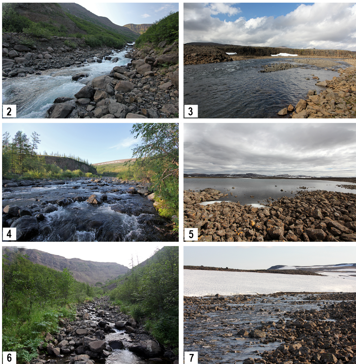
Fig. 2–7. Examples of habitats of Plecoptera on the Putorana Plateau. 2 — middle reach of river in NE environs of Lake Sobach'e (ca. 69°09.256' N, 91°53.958' E, h~370–400 m a.s.l.): habitat of Mesocapnia sp., Suwallia errata and Arcynopteryx polaris ; 3 — the Bunisyak River near inflow to NE end of Lake Bunisyak (69°17.3039' N, 92°10.9073' E, h~943 m a.s.l.): habitat of abundant larvae of Mesocapnia sp., Nemoura arctica and A. polaris ; 4 — lower reach of the Malyy Orokán River in SE environs of Lake Keta (68°45.226' N, 91°29.647' E, h~102 m a.s.l.): habitat of Eucapnopsis brevicauda , Mesocapnia sp., Alloperla mediata , A. rostellata , and A. polaris ; 5 — small lake in stony mountain desert N of Lake Bunisyak (69°18.1010' N, 92°08.3486' E, h~1075 m a.s.l.): habitat of Capnia zaitzevi ; 6 — upper reach of stream 3 km SW of W end of Lake Nakomyaken 2.5–3 km above mouth (ca. 68°50.653' N, 90°38.132' E, h~280–300 m): habitat of E. brevicauda , Mesocapnia sp., Paraleuctra zapekinae , Nemoura sp., S. errata , and A. polaris ; 7 — stream flowing into SE end of Lake Bunisyak (69°17.2070' N, 92°10.7155' E, h~945 m a.s.l.): habitat of Isocapnia guentheri and N. arctica .

Рис. 2–7. Примеры биотопов веснянок плато Путорана. 2 — среднее течение реки в северо-восточных окрестностях оз. Собачье (ок. 69°09.256' N, 91°53.958' E, h~370–400 м н.у.м.): биотоп Mesocapnia sp., Suwallia errata и Arcynopteryx polaris ; 3 — р. Бунисьяк у впадения в северо-восточную оконечность оз. Бунисьяк (69°17.3039' N, 92°10.9073' E, h~943 м н.у.м.): биотоп массового развития личинок Mesocapnia sp., Nemoura arctica и A. polaris ; 4 — нижнее течение р. Малый Орокан в юго-восточных окрестностях оз. Кета (68°45.226' N, 91°29.647' E, h~102 м н.у.м.): биотоп Eucapnopsis brevicauda , Mesocapnia sp., Alloperla mediata , A. rostellata и A. polaris ; 5 — озерко в каменистой горной пустыне к северу от оз. Бунисьяк (69°18.1010' N, 92°08.3486' E, h~1075 м н.у.м.): биотоп Capnia zaitzevi ; 6 — верхнее течение ручья в 3 км юго-западнее от западной оконечности оз. Накомьякен, в 2,5–3 км выше устья (ок. 68°50.653' N, 90°38.132' E, h~280–300 м н.у.м.): биотоп E. brevicauda , Mesocapnia sp., Paraleuctra zapekinae , Nemoura sp., S. errata и A. polaris ; 7 — ручей, впадающий в юго-восточную оконечность оз. Бунисьяк (69°17.2070' N, 92°10.7155' E, h~945 м н.у.м.): биотоп Isocapnia guentheri и N. arctica .